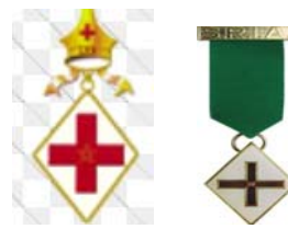
Societas Rosicruciana in Anglia

It was ones a part of the Allied Masonic Degrees, and in the United States it is still part of it.